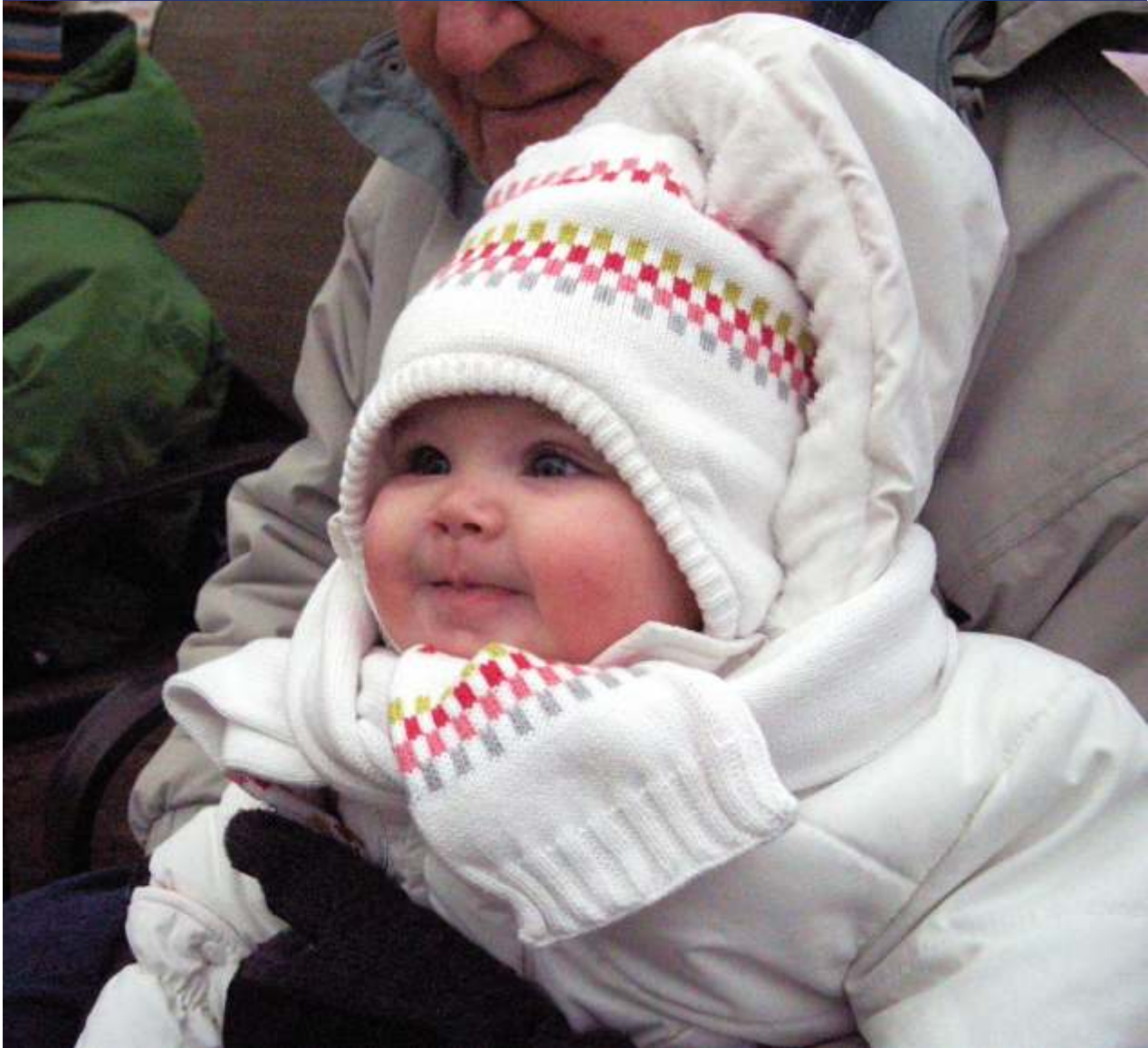
An enthusiastic young spectator enjoys the 2011 Christmas in Pippy Park pagament.

THIS ISSUE SPONSORED BY A MEMBER OF THE PIPPY PARK PROMOTIONS COMMITTEE