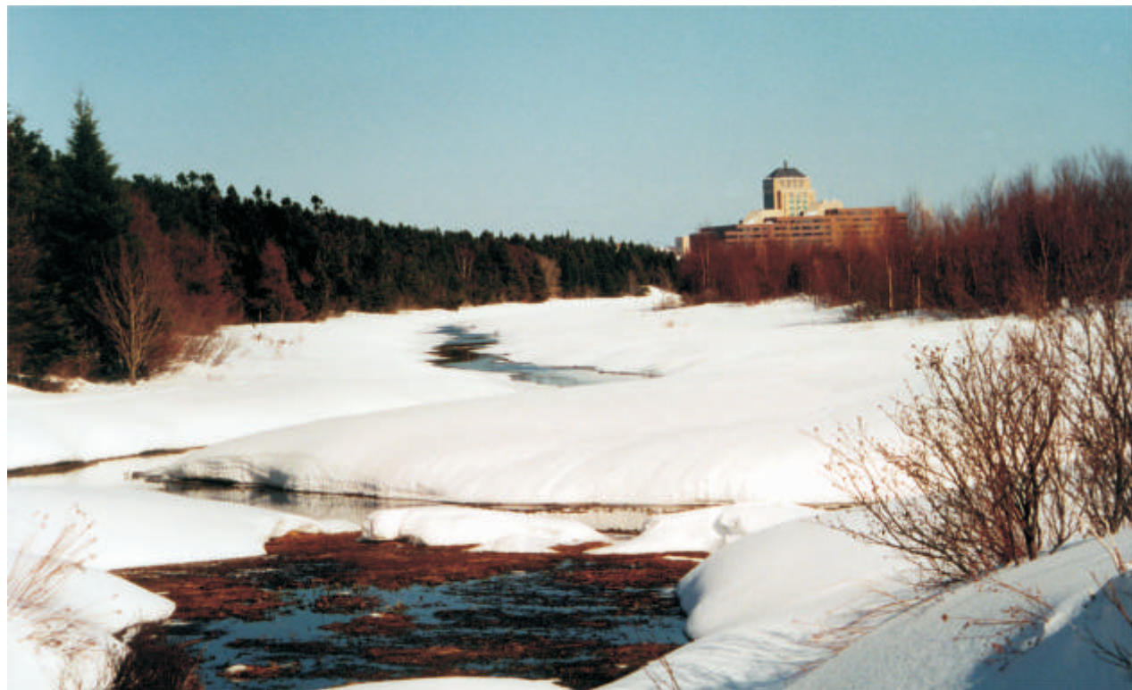
The "warm" waters of the Long Pond wetland keep the ice from forming and the snow from piling up during the winter months.