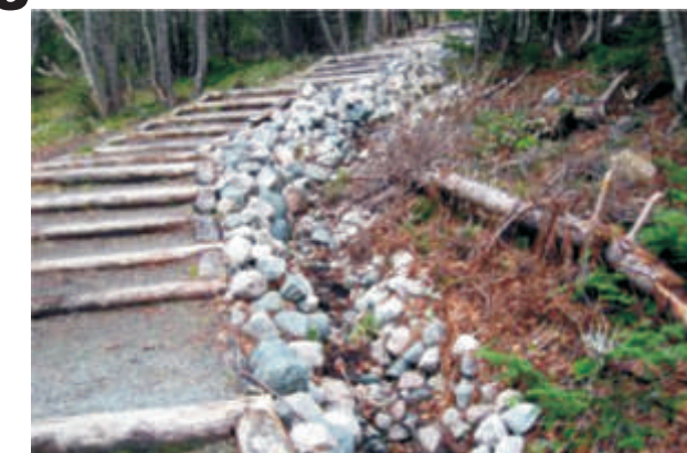
When the sun came out the following morning, the damage caused by the 67 mm downpour the night before was clearly seen in front of the Country Laundry (left). The steep Grand Concourse Trail up over Mount Scio (Long Pond to Oxen Pond) fared better with less damage. (right).