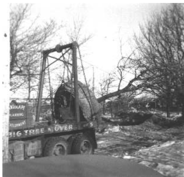
Trees being moved from Colonial Building grounds for transplanting at Confederation Hill and Memorial University in February, 1966.

In discussing the development of the park over the years Joey Smallwood had specifically told me to find mature trees to plant around the University and Confederation Building. "We don't have time to wait for small trees to grow." I had some doubts as to whether they could survive being relocated to such ex-