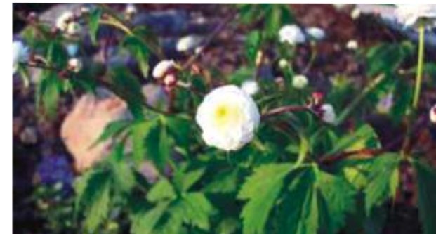
Photo: Ranunculus aconitifolius "flore pleno".

One of the more interesting plants that they have re-introduced to the trade is the "Fair Maids of France" This double white flowered relative of the Buttercup was found in an outport garden a few years ago.