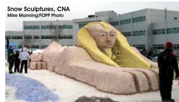
Snow Sculptures