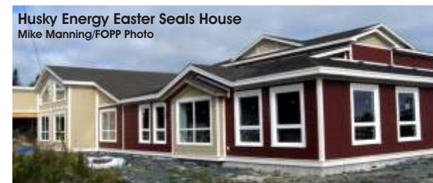
Husky Energy Easter Seals House

Students at the College of the North Atlantic has good amounts of snow this year for their annual Snow Sculpture Competition on the Prince Philip Drive Campus in Pippy Park. The sculptures were very impressive indeed.