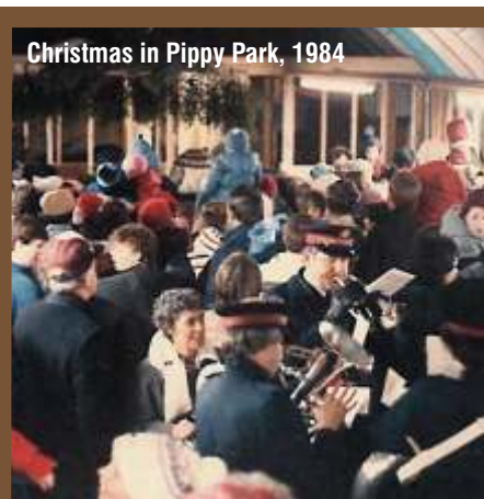
Christmas in Pippy Park, 1984