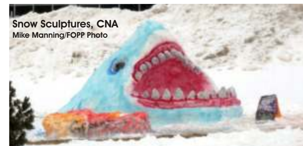
Snow Sculptures