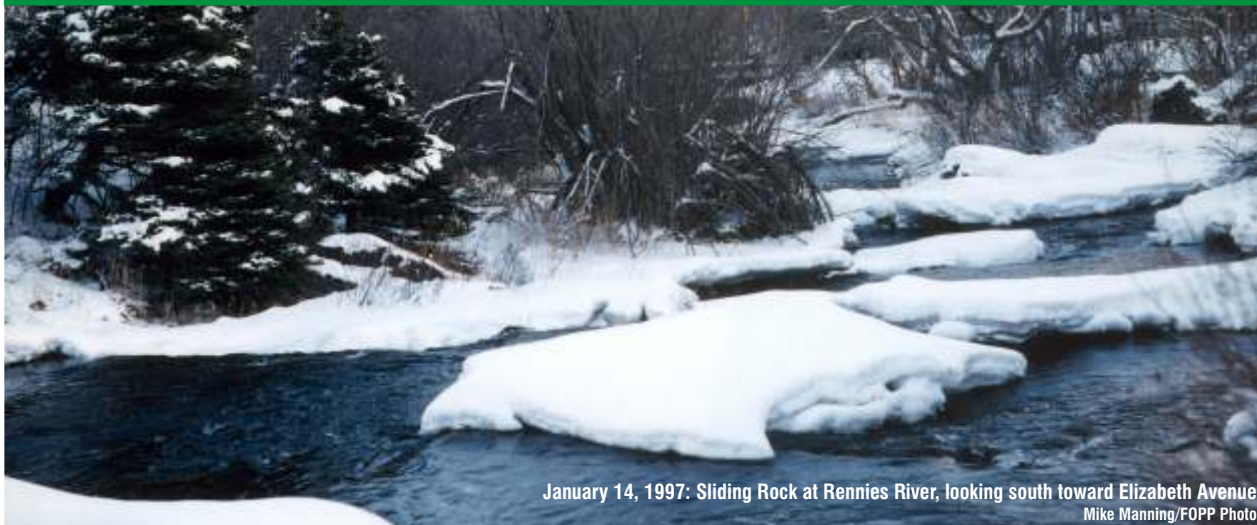
January 14, 1997: Sliding Rock at Rennie's River, looking south toward Elizabeth Avenue