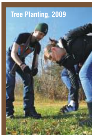
Tree Planting, 2009

Also in 1986 permission was given to hold the Eastern Canada Water Ski Championship on Long Pond. Many groups, including the Friends were publicly opposed to this. The Pippy Park Commission however took every precaution to make sure there was no pollution and no significant disturbance to the wildlife during the two day event. Consultants