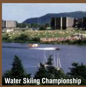
Water Skiing Championship

construction of the Outer Ring Road to its completion in 2002.