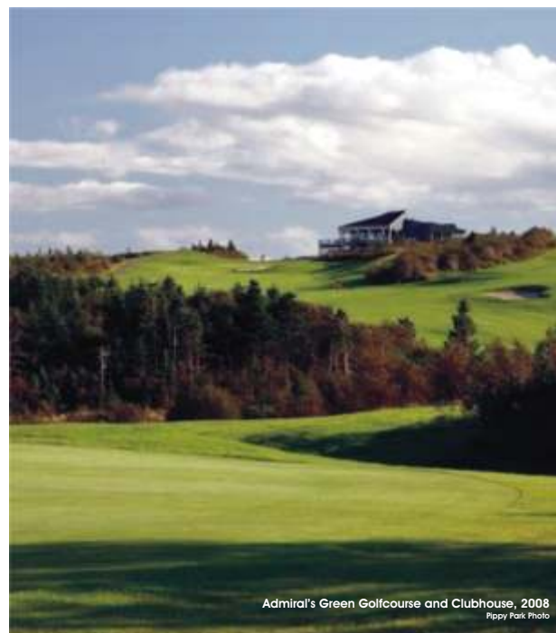
Admiral's Green Golfcourse and Clubhouse, 2008

The Fluvarium 5, Nagles Place www.fluvarium.ca phone (709) 754-3474 provides a unique underwater experience where freshwater wildlife can be watched in their natural habitat. There are lots of exhibits and activities for children. The Fluvarium is open daily.