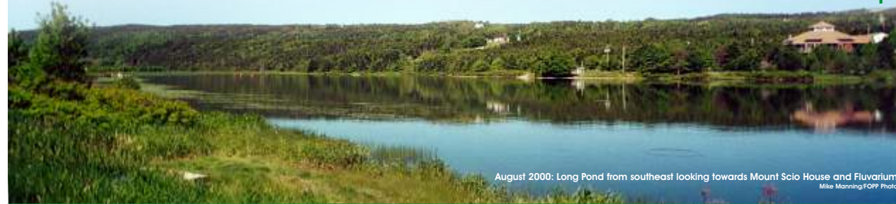
August 2000: Long Pond from southeast looking towards Mount Scio House and Fluvarium