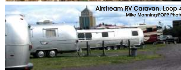
Airstream RV Caravan, Loop 4