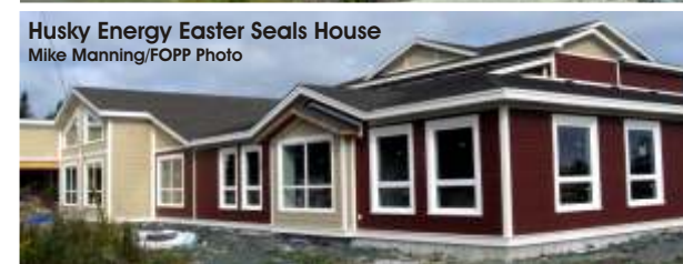
Husky Energy Easter Seals House