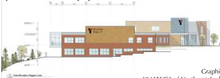
Graphics: YM-YWCA of Northeast Avalon

The building and parking lots are to be set back from the corner and well screened with trees. While extra traffic is anticipated it is not expected to cause a major problem. Most of the local residents were pleased with what was proposed.