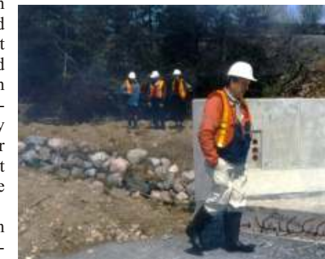
Members of the Outer Ring Road Environmental Advisory Committee keep a watchful eye on construction progress during a monitoring tour on May 23, 1996.

ings for three weeks in March of 1993. One of the most important recommendations in the Goodyear