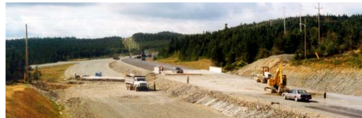
Construction was well advanced when this picture of the work-in-progress was taken on September 14, 1998 on the Outer Ring Road at the Nagles Hill overpass, just below the golf courses.