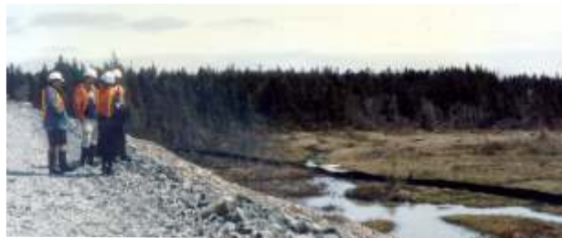
Outer Ring Road Environmental Advisory Committee members inspect the environmental protection measures installed to protect Fogarty's Wetland during construction, May 23, 1996 [Above]. Fogarty's Wetland after the Outer Ring Road opened. [Below]