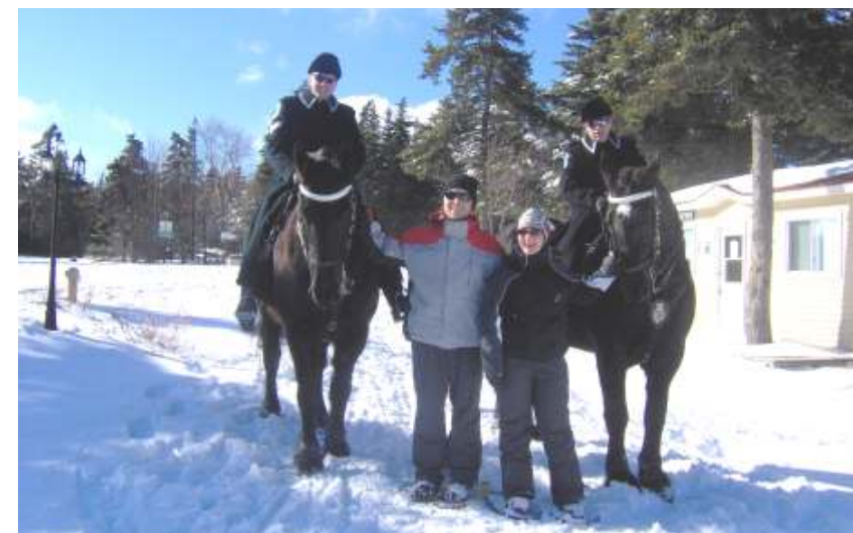
Star attractions at Pippy Park's Winterfest '08 were members of the Royal Newfoundland Constabulary's Mounted Unit, shown here at the entrance to the Park Campgrounds. More details inside.