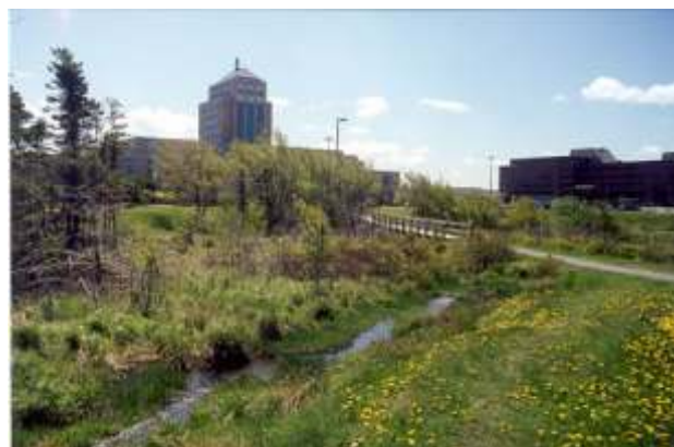
Pippy Park grew around the desire to have a park-like setting for public institutions in St. John's. Here, Confederation Building East and West Blocks (left and right) are surrounded by pleasant landscapes, brooks and groomed walking trails.

The main campus of Memorial University is within Pippy Park and the nationally celebrated Botanical Garden at Oxen Pond has been one of the most important assets in the park to have been developed during the past 40 years. It provides environmental education to thousands of school-children and visitors every year in an inspiring setting. The setting combines a first class collection of exotic Alpine and Ericaceous plants with a thoroughly enjoyable insight into