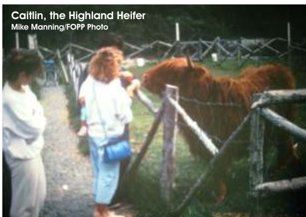
Caitlin, the Highland Heifer