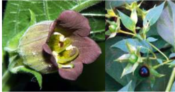
Deadly Nightshade Flower (left), Leaves and seeds (right)