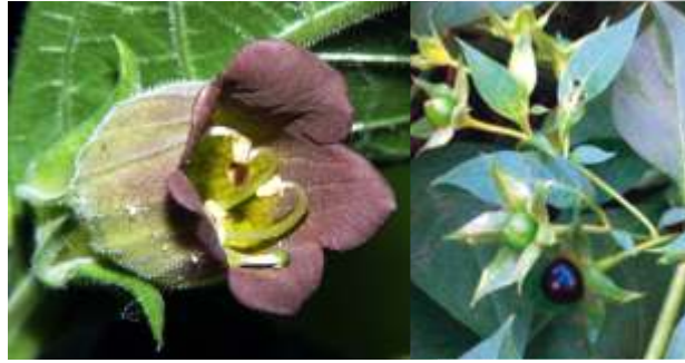
Deadly Nightshade Flower (left), Leaves and seeds (right)