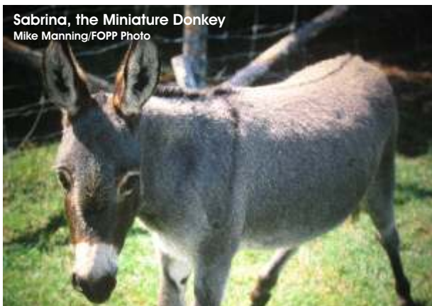
Sabrina, the Miniature Donkey