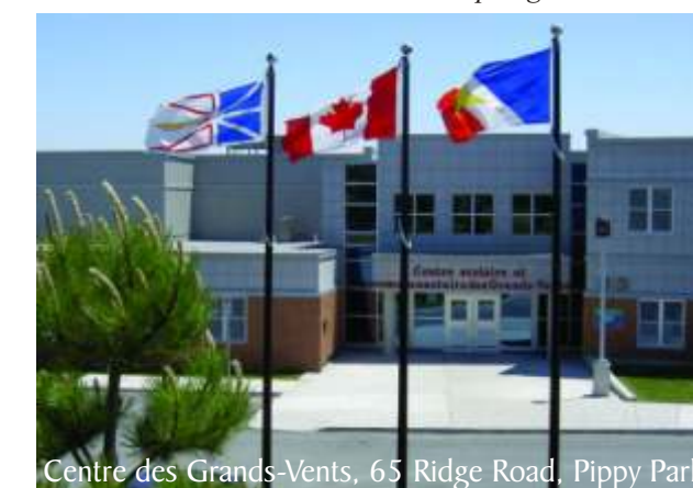
Centre des Grands-Vents, 65 Ridge Road, Pippy Park